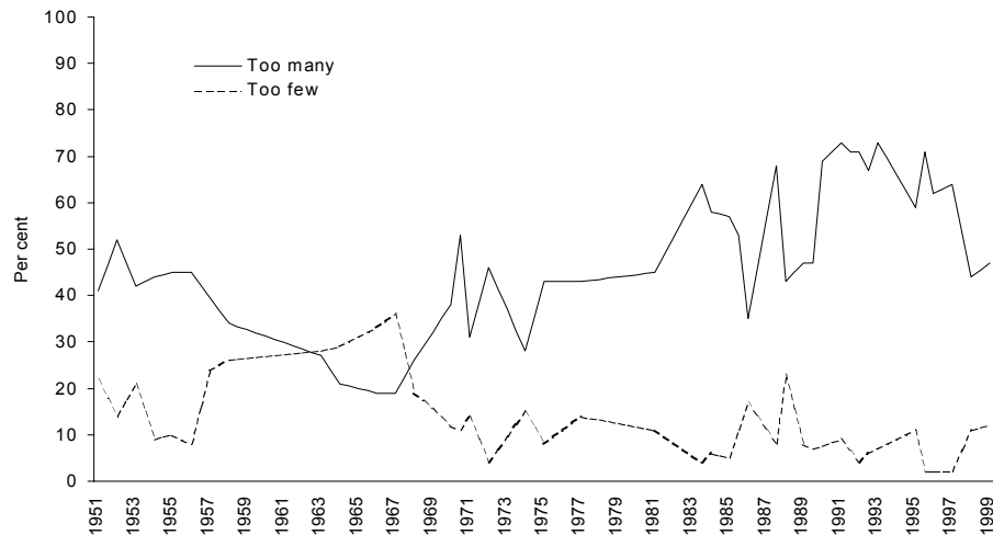
Figure 2: Murray Goot's data on attitudes to immigration, 1951 to 1999, per cent indicating the numbers are 'too many' and per cent indicating they are 'too few'.