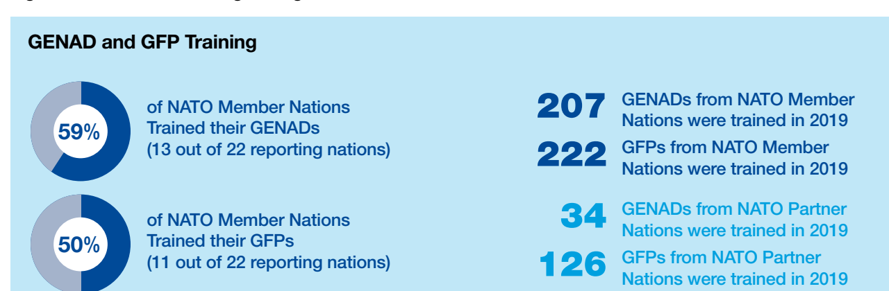
Figure 8: Overview of training among NATO member nations in 201975