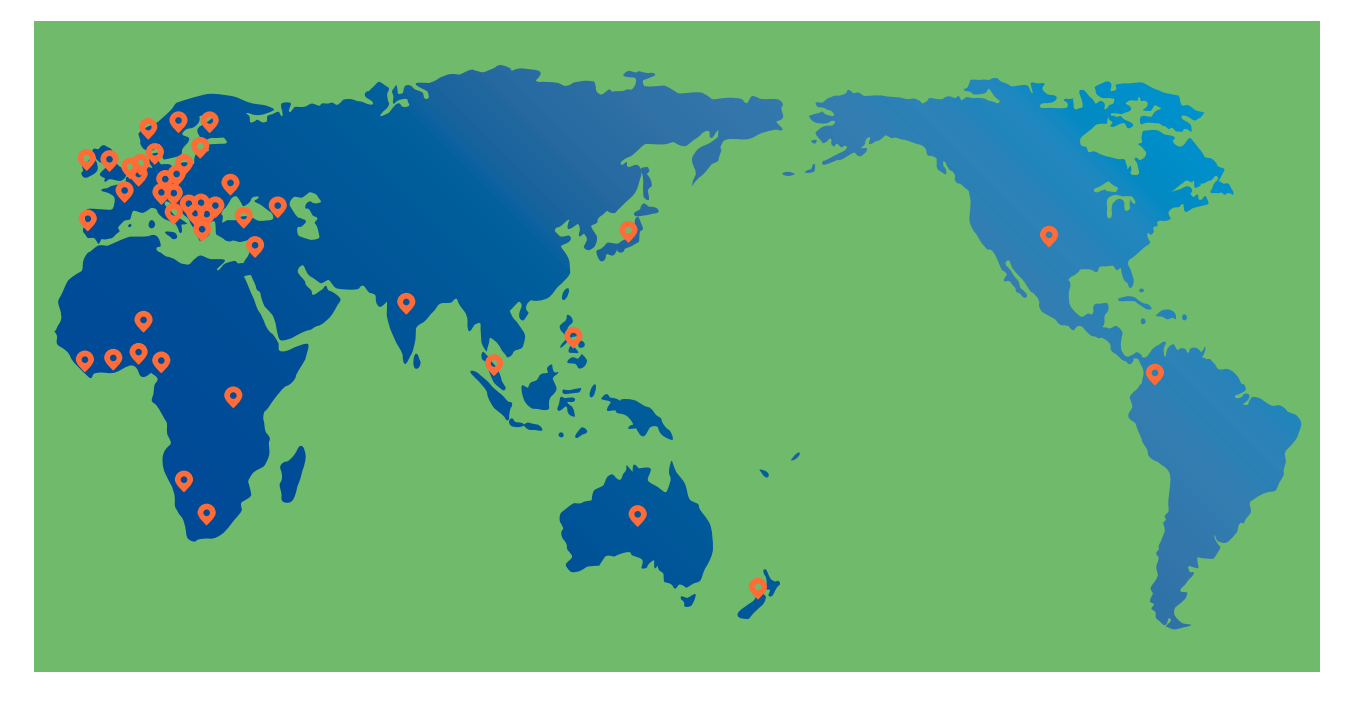
Figure 2: Countries with known military GENAD capabilities<sup>16</sup>

Since the mid-2000s, military GENAD capabilities have been expanding around the world. The first military GENAD was appointed to a European Union (EU) multilateral operation in 2006, followed by the development of GENAD capabilities in NATO.<sup>11</sup> In NATO's most recent report on gender in armed forces, 32 NATO member and partner countries reported having GENAD or GFP capabilities in their ministries of defence, general staff and/or national armed forces. Further, within NATO's member states, there are 359 GENADs and 603 GFPs, the overwhelming majority within national armed forces.<sup>12</sup> Within the African Union, at least seven nations have engaged in efforts to develop a GENAD capability;<sup>13</sup> in Asia and the Pacific, the Philippines and Malaysian defence forces have a GENAD capability;<sup>14</sup> and in South America, Colombia is reported to be developing one.<sup>15</sup>