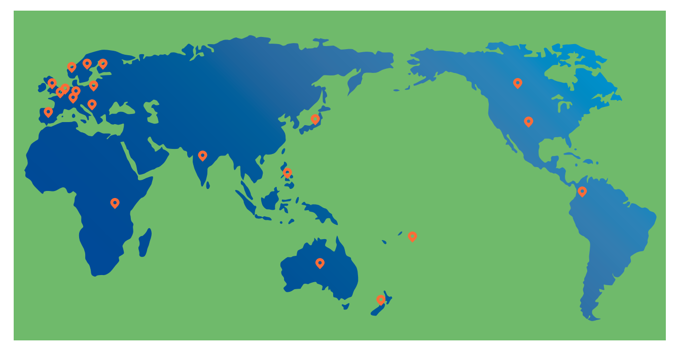
Figure 3: Location of research respondents

Depending on their expertise and experience, interviewees were asked questions about their understanding and experience of working in or with a military GENAD capability, its role within military organisations, examples of good practice, challenges they or the capability had faced, and ways in which the capability can be strengthened.