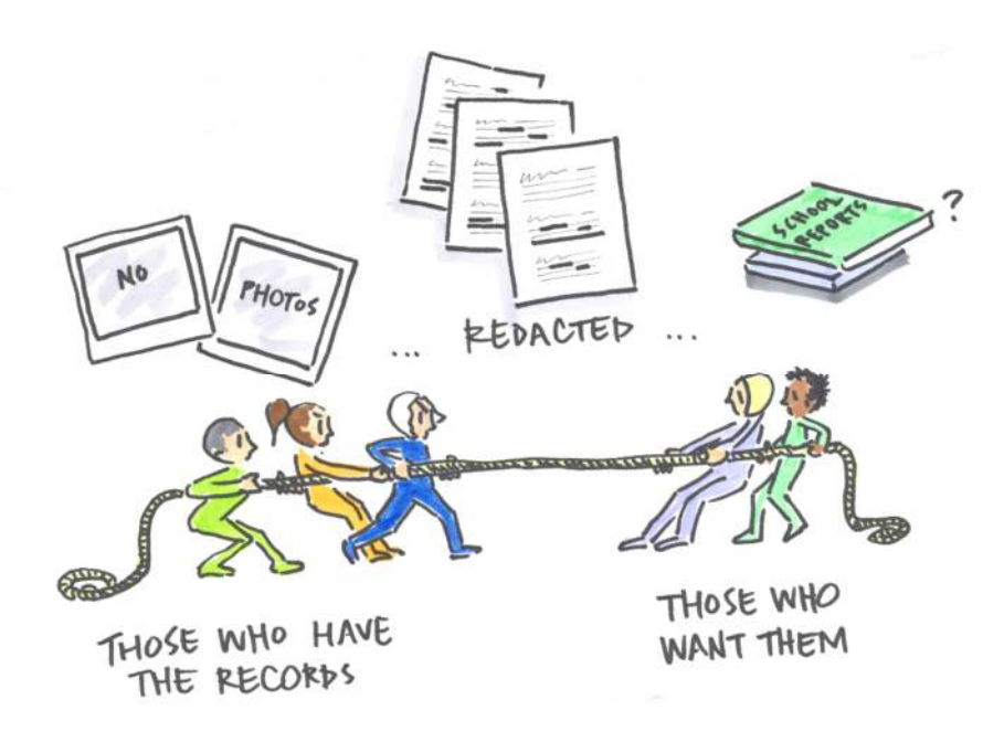
Fig 1 One of the most popular illustrations from the graphic notetaking at the Summit by Matthew Magain from Sketch Group

While current standards for out-of-home care emphasise the need to put the physical, emotional, spiritual and social health and wellbeing of children and young people at the centre of service provision, they are being implemented on recordkeeping infrastructure built for previous eras of child protection and welfare. Current frameworks, processes and systems put the rights of the organisations, institutions and governments providing and responsible for out of home care ahead of those of children and their adult selves. They exclude children and young people from participation in decision-making about their records and continue that exclusion throughout adulthood. The recordkeeping needs of a child-centred model of out of home care cannot just be incrementally added onto existing infrastructure designed for a different age, different values, different principles, and a different technological paradigm.