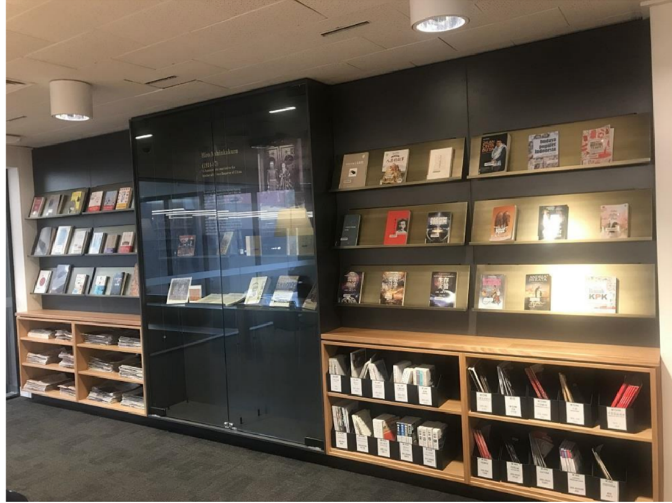
The Asian Collections Display at Sir Louis Matheson Library